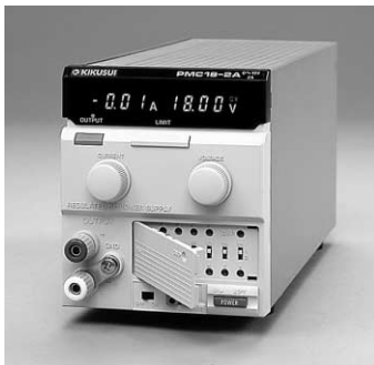
Various adjustment dials and remote control setting switches are located on the sub-front panel.